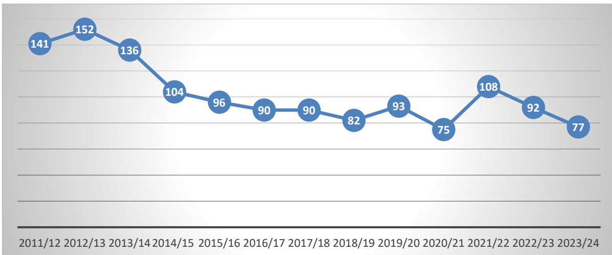
Table 1: Number of New Entrants 2011/12 to 2023/24

A total of 77 new members joined the Law Library in October 2023.